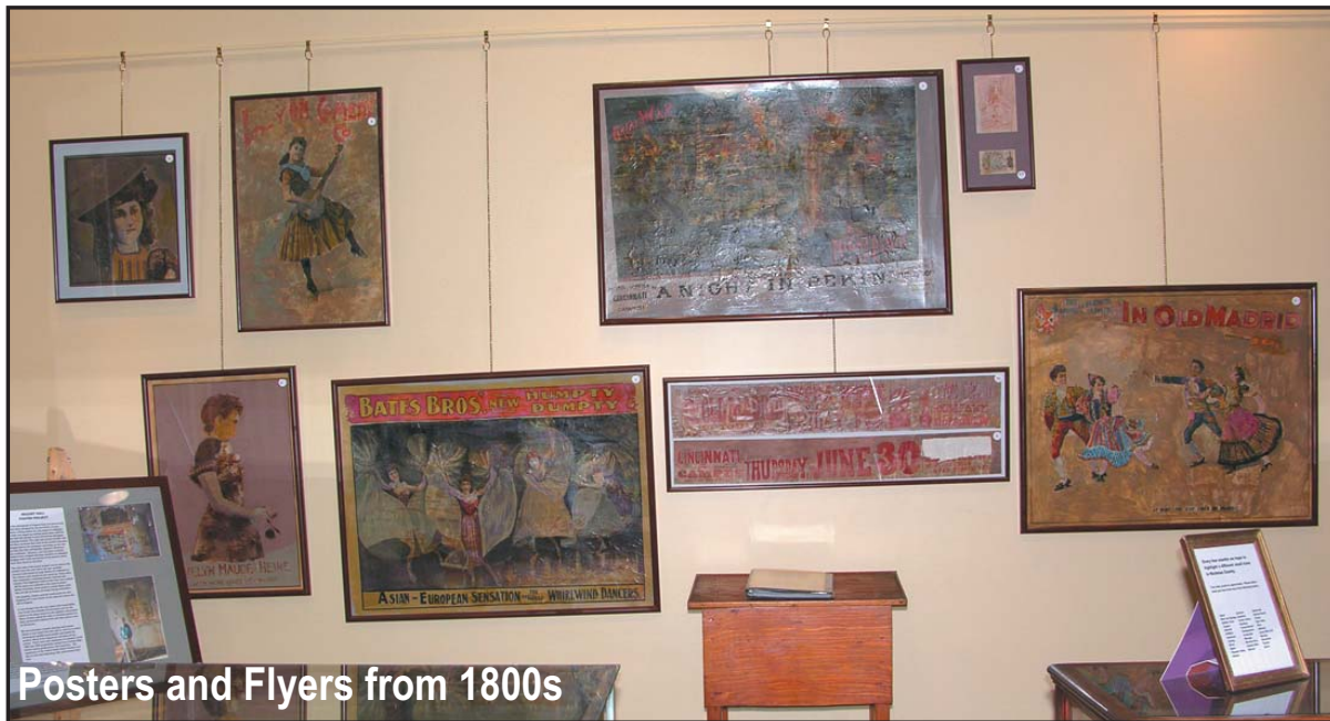
Posters and Flyers from 1800s